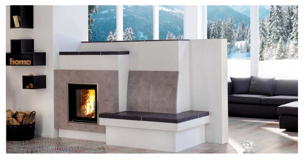
Heating with wood saves costs and creates a relaxed atmosphere.

In view of increasing oil prices, the installation of a modern fireplace or wood burner can contribute to lowering heating costs and, at the same time, help in creating an atmosphere of well-being in the building.